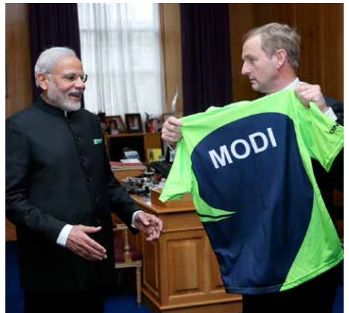
Prime Minister held a one-to-one meeting with Taoiseach Enda Kenny in which bilateral relations and issues of mutual concern were discussed. After the meeting, while the Taoiseach handed over to PM a specially designed Ireland Cricket Team Jersey with PM Modi's name